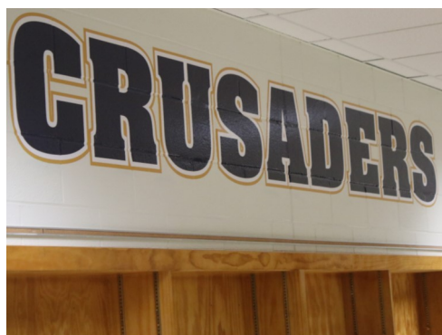
Freshly painted hallways showing our Crusader spirit !