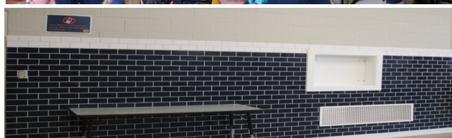
Not only did our cafeteria receive a fresh coat of paint and some splashes of Notre Dame pride with the school's logo and seal, the green tile has been replaced with beautiful navy tile. Additionally, the school lunch program is now incorporating software for track lunch payments .