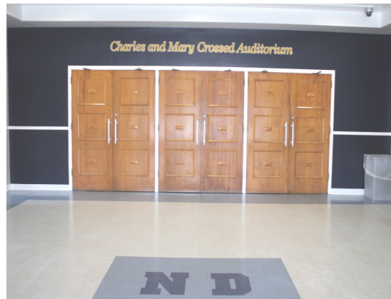
Auditorium restrooms received a full makeover including new paint, flooring, bathroom stalls, sinks and fixtures. The lobby now proudly acknowledges our benefactors Charles and Mary Crossed.