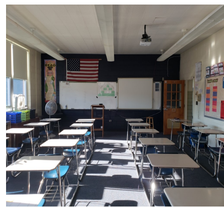
Navy blue accent walls in the classrooms and new carpet in the technology and theology classroom.