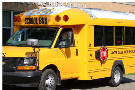
New 20 passenger bus for transporting Ithaca students to St. Mary Our Mother School & Notre Dame.