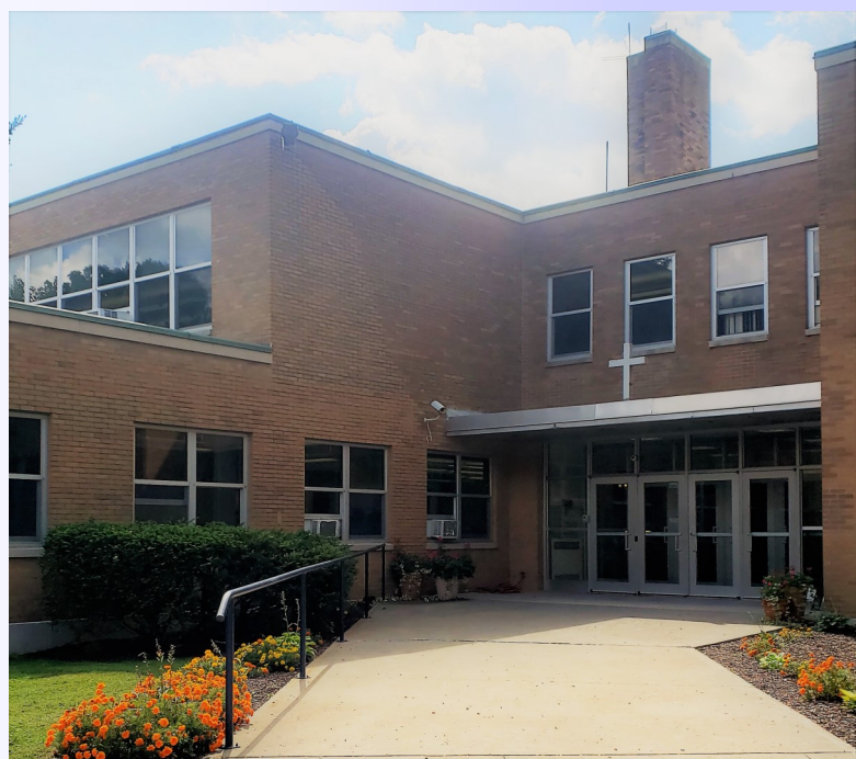
Landscaping around the Notre Dame Campus

I'm also enthusiastic about the new faculty and staff we have joining us for the new year. Having been able to start the interview process earlier this year, we had a solid selection of candidates from which to pool and were able to take our time in ensuring we had a good fit to meet the expectations of our students and parents as well as the culture of Notre Dame HS.